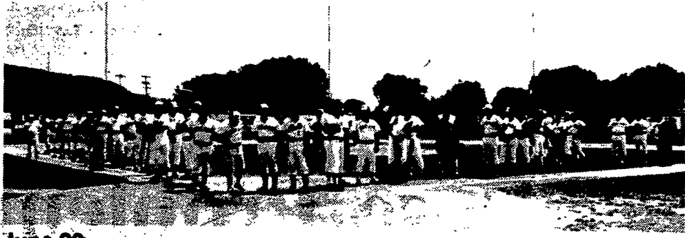
June 26 Old Timers' Baseball Game