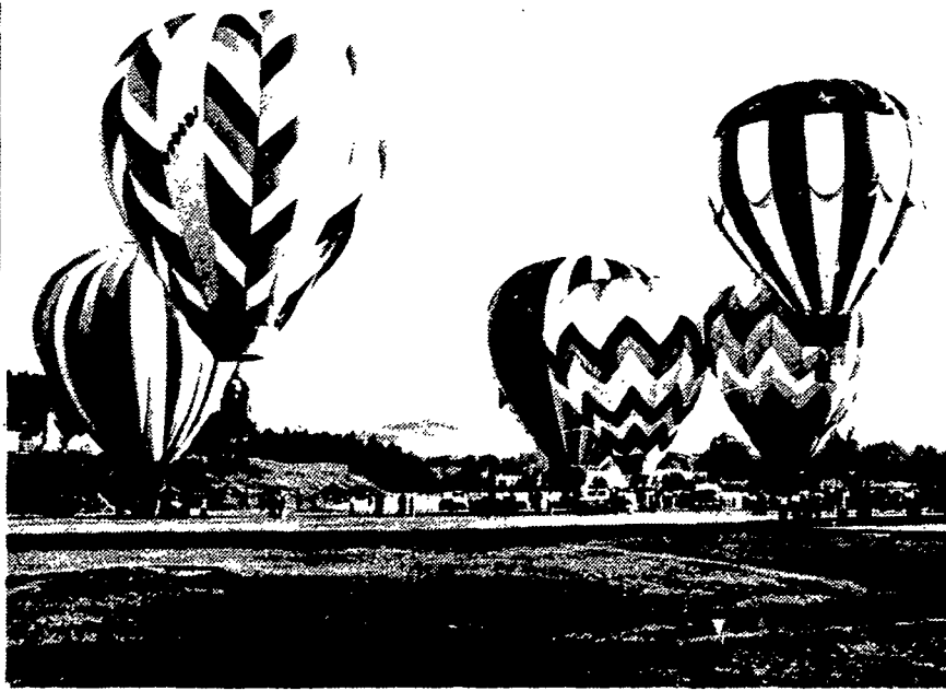
August 12, 13, 14 Sesquicentennial Festival of Balloons

October 22 The 150th Anniversary of the Chemung Canal Trust Company's first day of business