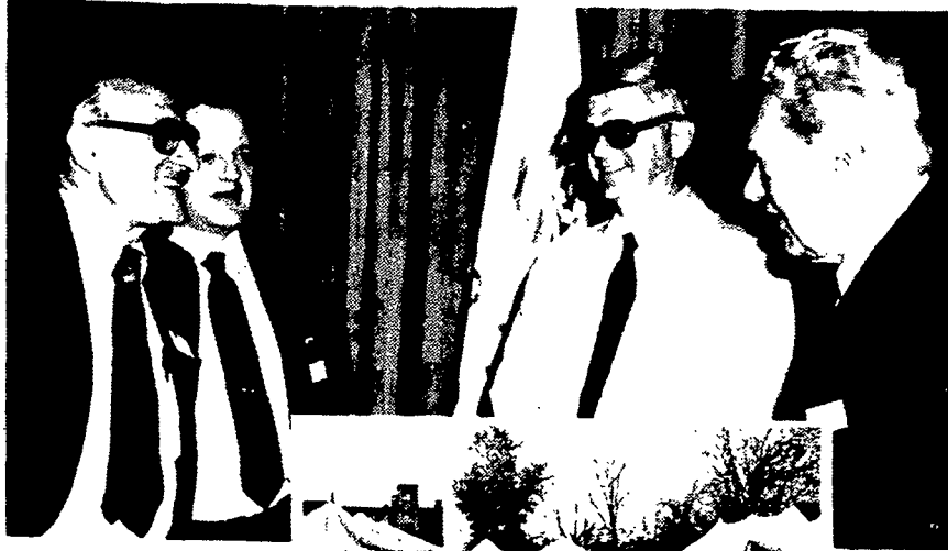
May 20 Sesquicentennial Business And Community Leaders Luncheon Speaker: Dr. Alfred E. Kahn Antique Show & Sale