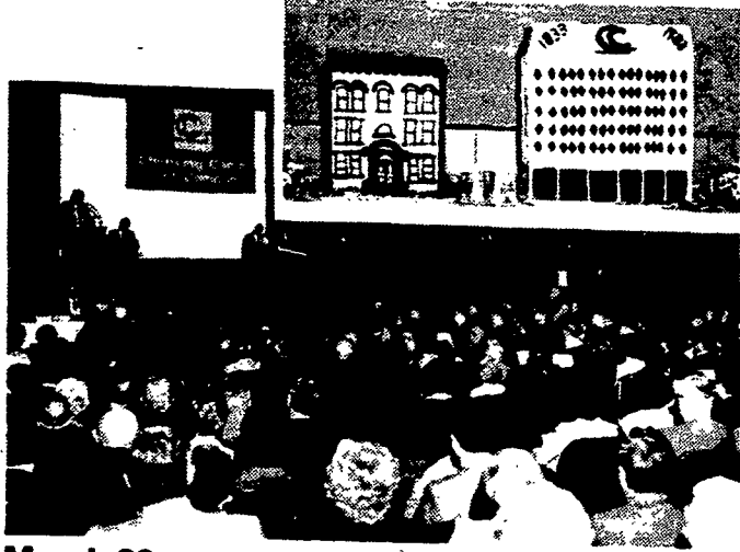
March 26 Annual Meeting of Stockholders