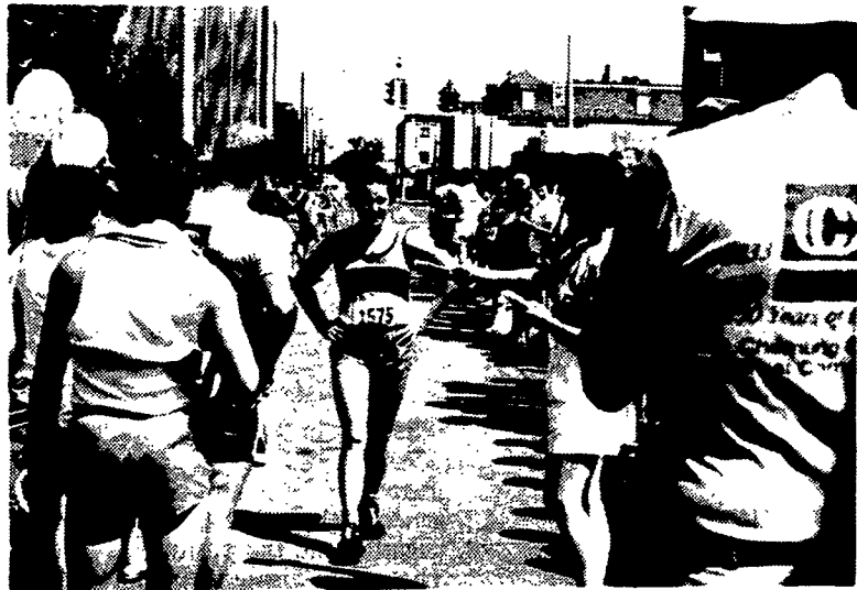
July 17 Sixth Annual Elmira-Thon