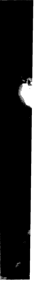
Religious Presbyter attended the day f (right), st