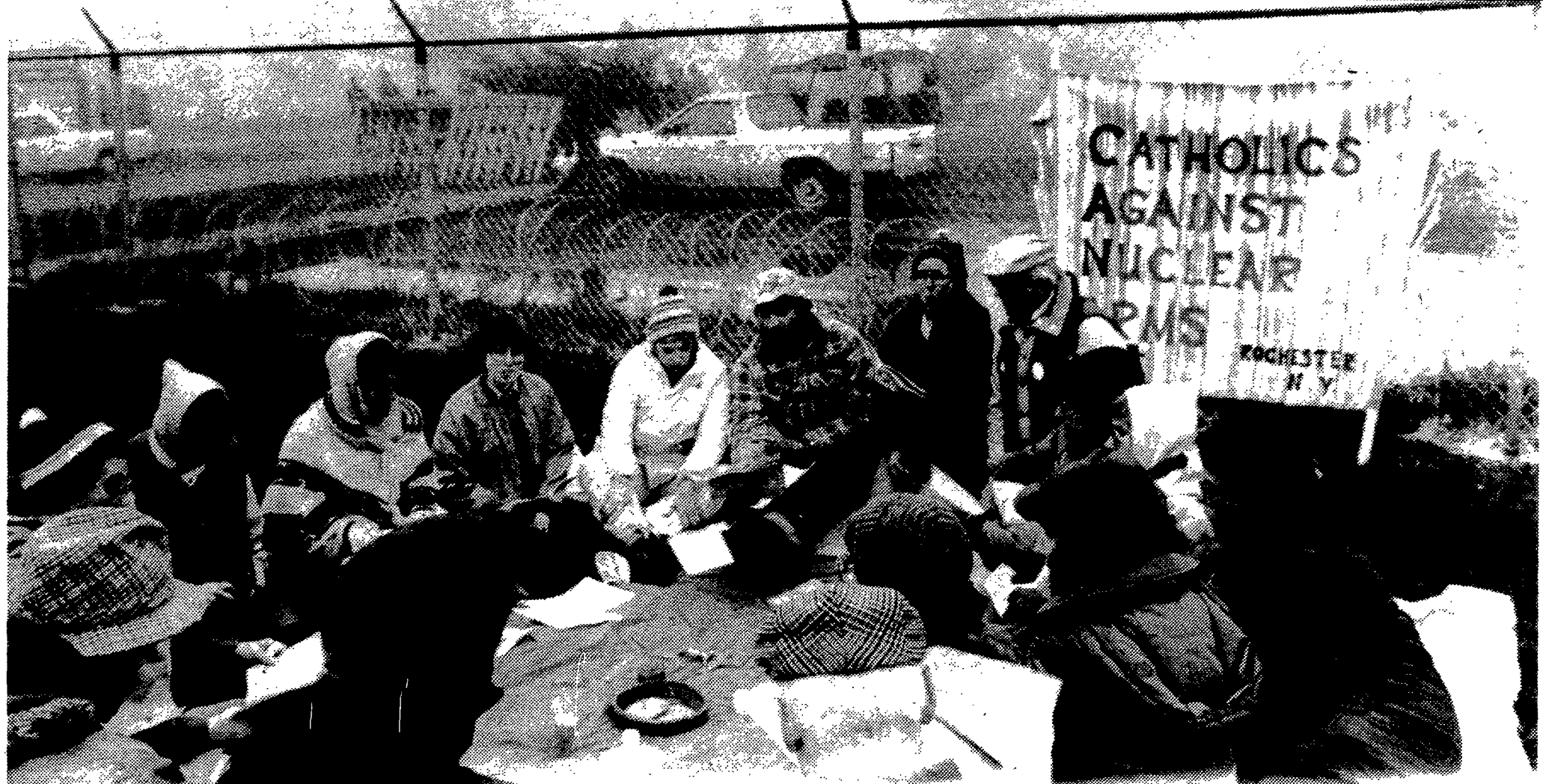
Prayer vigils and services are a major part of the Catholic experience of the weekend of protest surrounding the deployment of the Cruise and Pershing II missiles. At top, worshippers gather at St. Stanislaus Church, one of 15 Catholic churches across the diocese to be open for such an event, Friday, Oct. 21. Middle