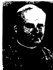
THE HOLY FATHER'S MISSION AID TO THE ORIENTAL CHURCH

The fee for the workshop is $2 per person. Pre-registration is made by calling the Office of Religious Education (716) 328-3210 by Friday, Oct. 21.