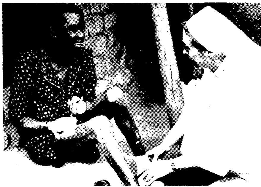
"One is coming after me...and I am not fit to undo his sandal-strap" (Jn. 1:26-27). Serving the suffering -- the least of His brothers -- the Church's missionaries serve the Lord. Kneel down with them before Jesus on World Mission Sunday, Oct. 23.