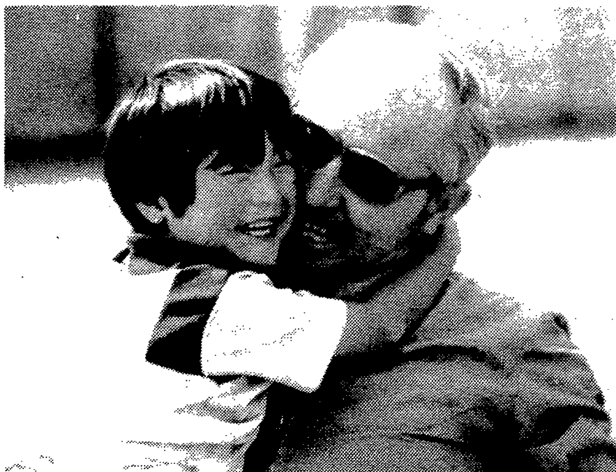
Pope John Paul II urges us, "Let your faith shine before the world as a lamp in the darkness." And the light of love is reflected back a hundredfold in power. Be a shining example of faith and love on World Mission Sunday, Oct. 23.