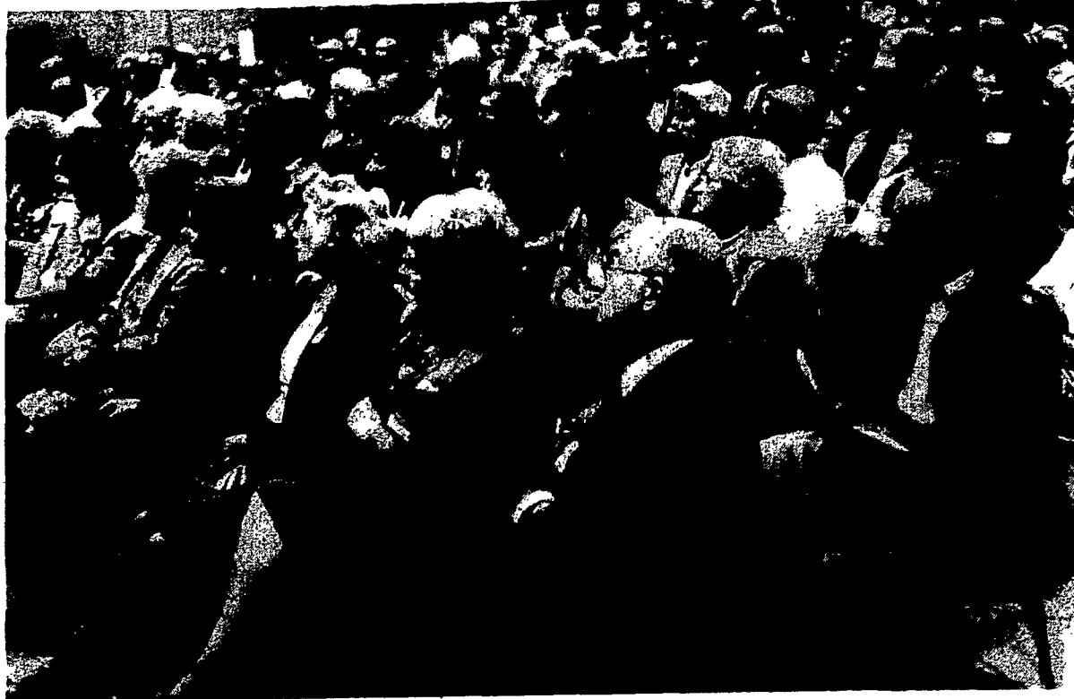
Some of the nearly 200 persons at Sunday's hearing at St. Patrick's school in Seneca Falls.

As for the other speakers at the peace rally, the bishop stressed that "I don't go there to endorse abortion, communism or unilateral