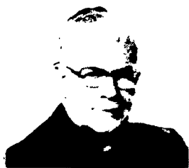
On the Right Side