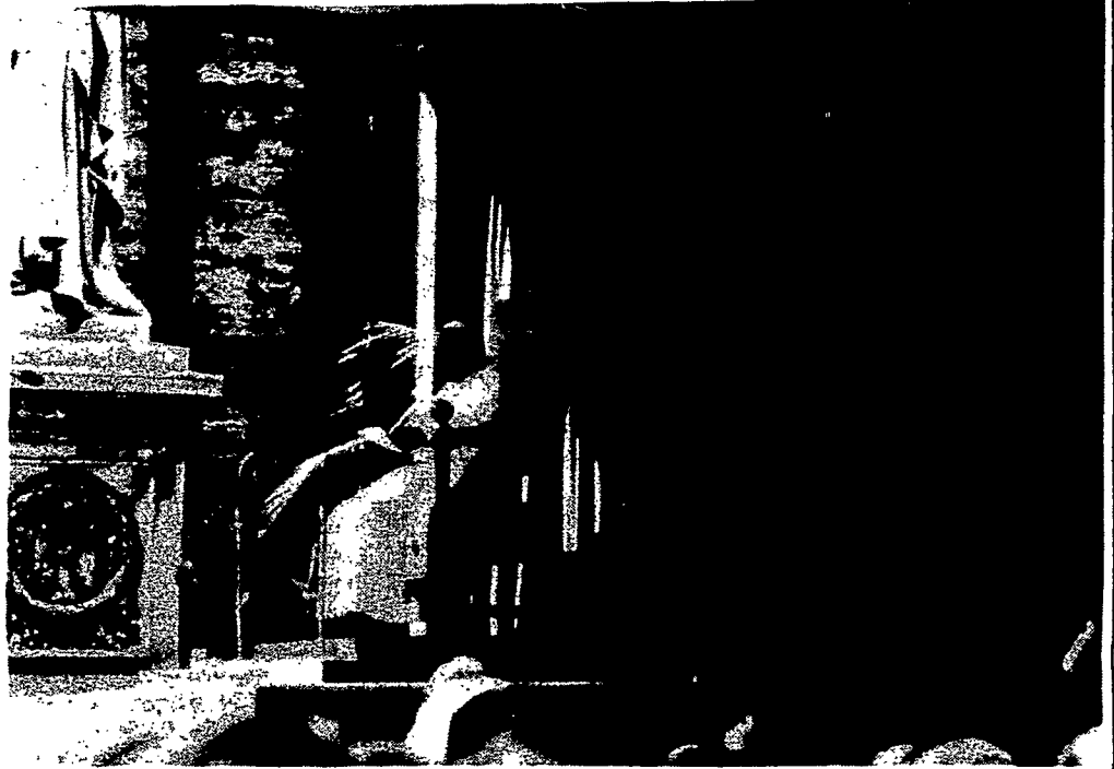
Pope John Paul II at the General Audience on Sept. 14.