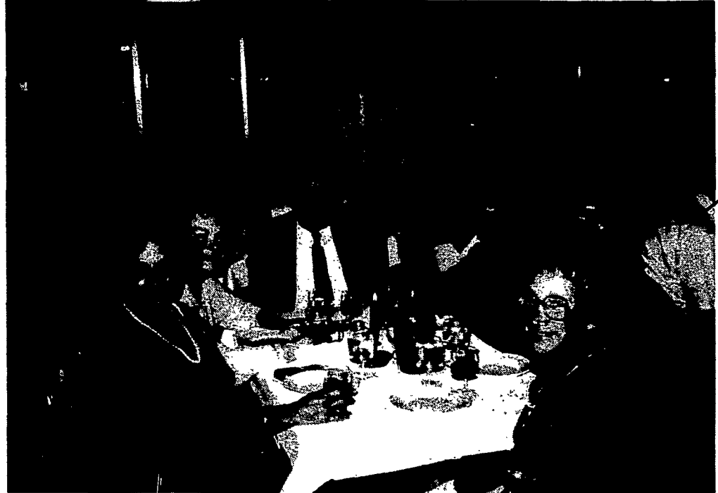
Part of the tour group dining in Sorrento.

"I could n on my way t and his thou attitude that Holy Year F on Sept. 4.