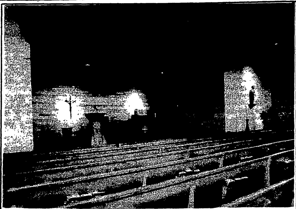
Christ the King, Rochester