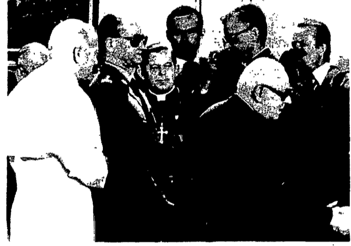
On his arrival, Pope John Paul greets the Polish bishops, including Cardinal Josef Glemp, center. The pope is accompanied by government leader Wojciech Jaruzelski, in uniform, and Polish President Henryk Jablonski, reaching to shake someone's hand.