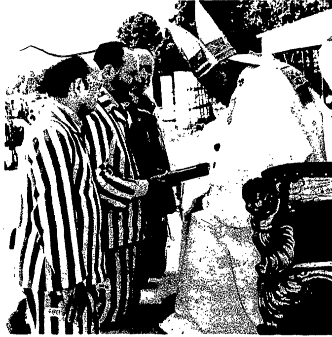
Dressed in prison garb, three survivors of a World War II Nazi concentration camp talk with Pope John Paul II during a Mass at the Wroclaw Hippodrome.