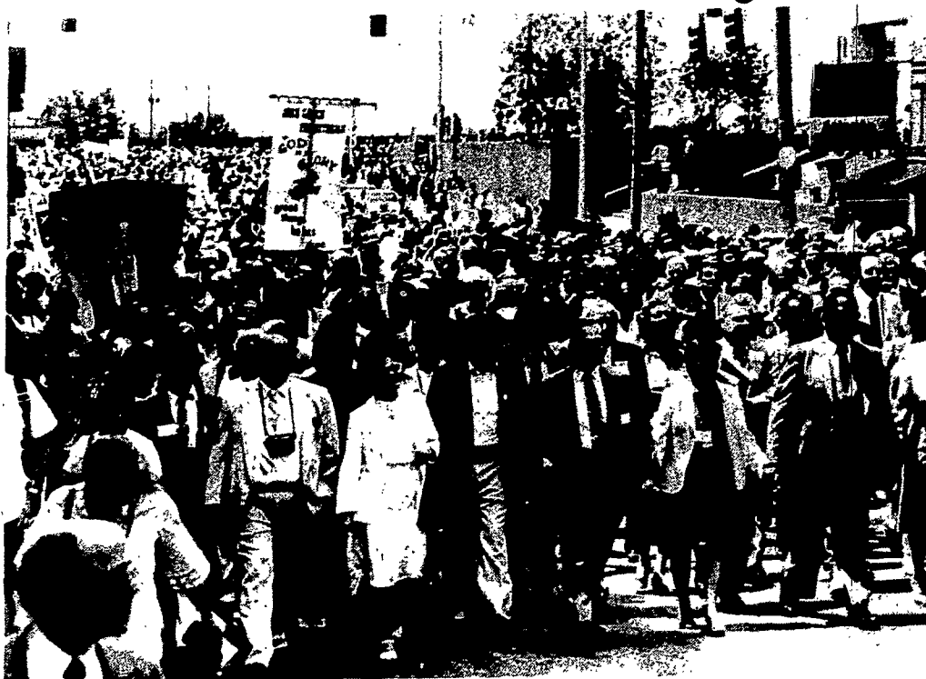
Thousands of Presbyterians march through downtown Atlanta, Ga., in celebration after voting to re-unite as one denomination in the United States. The congregation had split into North and South factions 122 years ago.