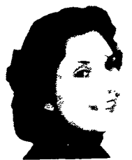
All in the Family