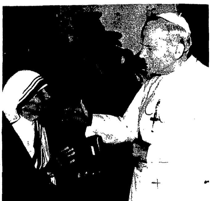
Mother Teresa of Calcutta smiles as Pope John Paul II gives her the registration book for a car to be used in her order's work among the poor. The car was given to the pope during his recent visit to Milan.