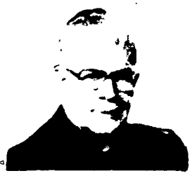
On the Right Side