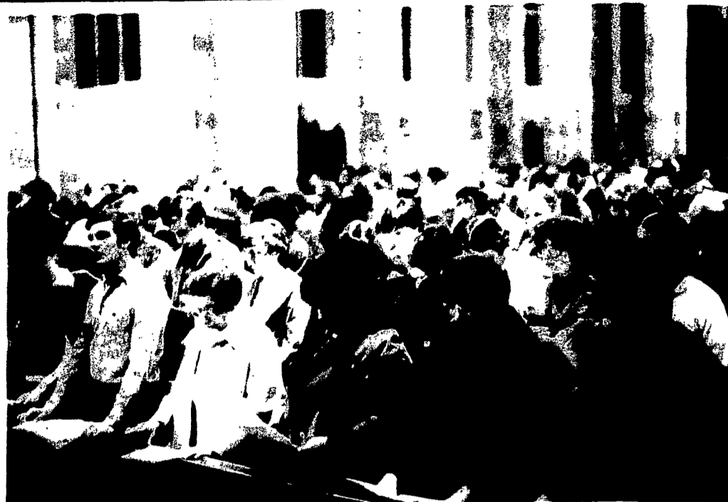
Some of the more than 1,200 who attended the Chrism Mass.