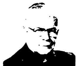
On the Right Side