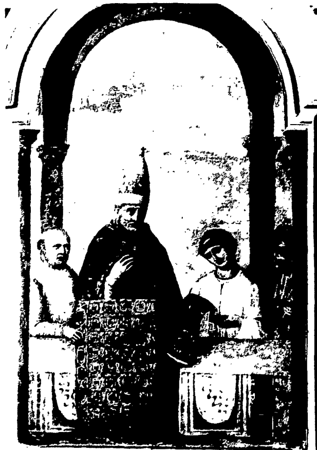
Pope Boniface VIII reads the bull which announces the first Holy Year in 1300. This fresco by Giotto is in the basilica of St. John the Leteran in Rome.