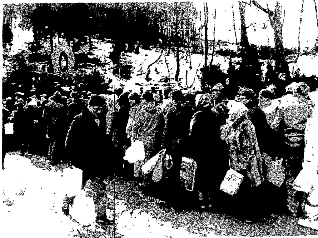
Visitors with plastic containers and bottles line up to get water from a spring in Ranschbach, West Germany. During the past few weeks more than 60,000 people have swarmed the small Rhineland village after reports of miraculous cures began appearing in the West German press.