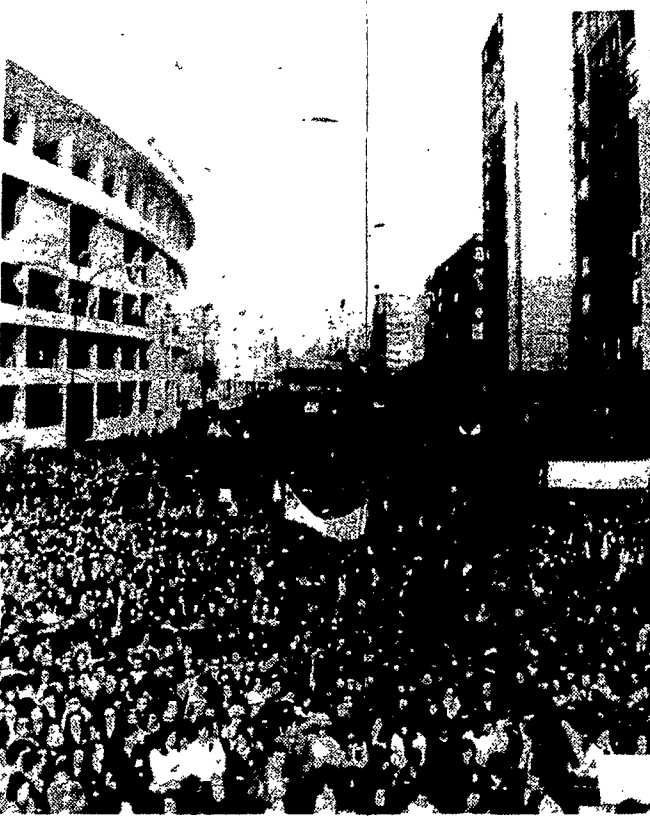
Several hundred thousand Spaniards rally in downtown Madrid to express their opposition to the socialist government's efforts to liberalize Spain's abortion laws. With the theme "No to abortion, yes to life," the demonstration was the largest yet in a heated national debate.