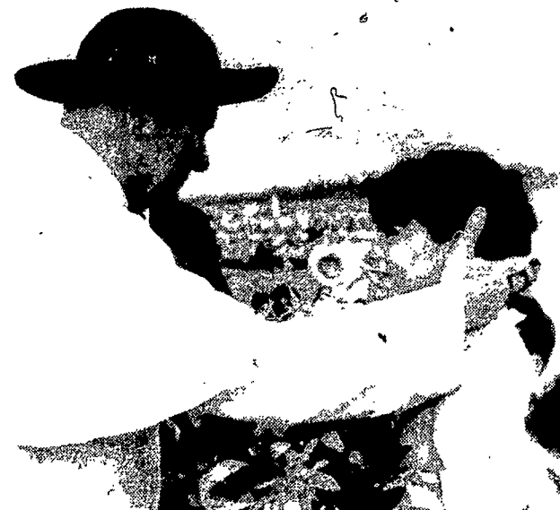
At San Pedro Sula, Honduras' second largest city, Pope John Paul II thanks a local girl who gave him a bouquet of roses.