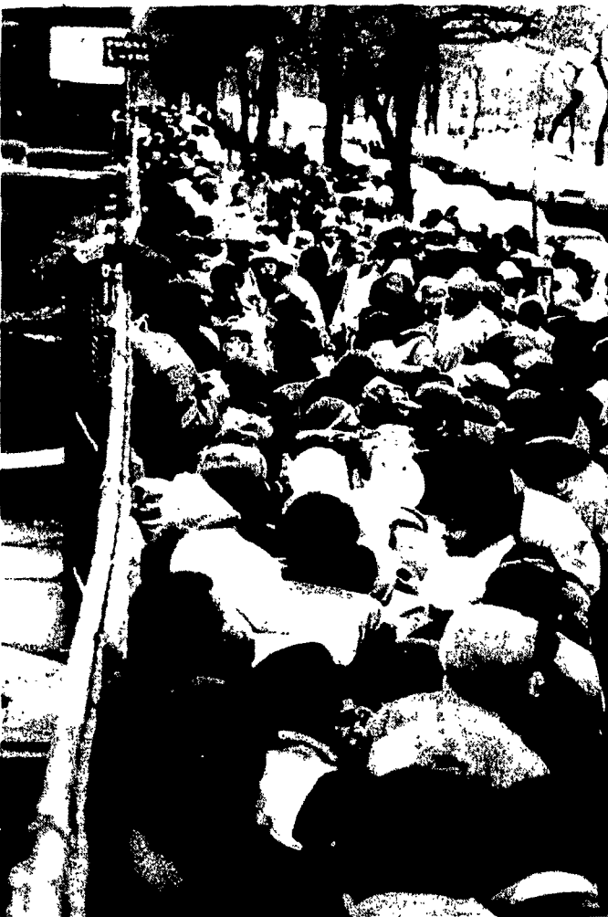
▲ Two days before Christmas, about 2,500 people line the sidewalk outside Mt. Pisgah Baptist Church on Chicago's South Side for a Christmas food giveaway. As many as 10,000 of Chicago's poor were expected to stop at the church throughout the day for the free food.