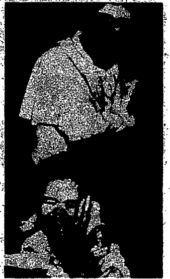
▲ In Alcira, Spain, near the end of the pontiff's trip, a child seems unimpressed by the illustrious visitor as Pope John Paul II prays before a Marian statue.