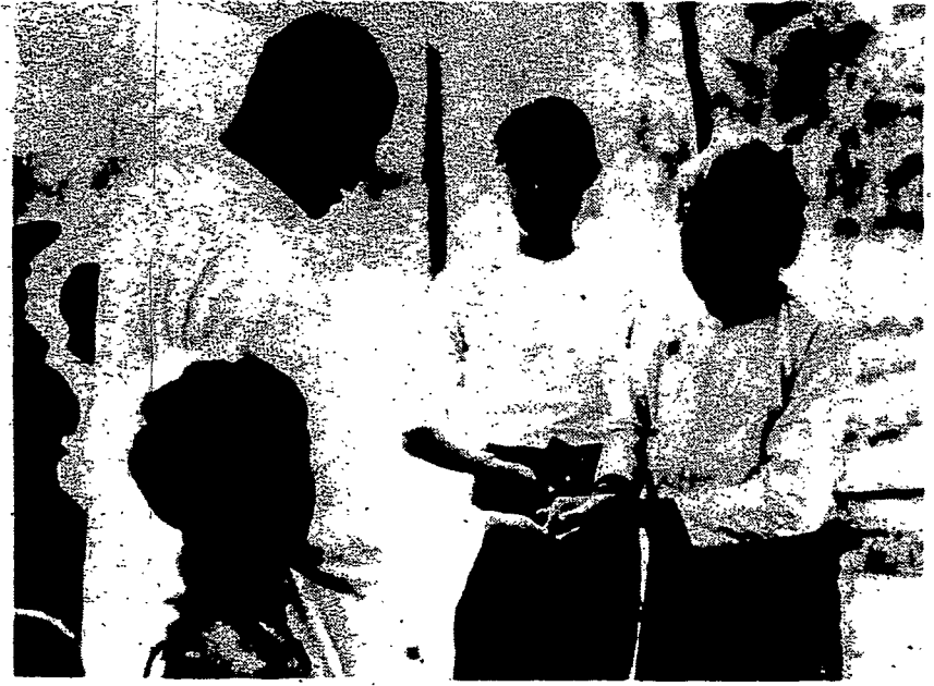
This priest in Burma, like missionaries throughout the world, nourishes both the physical and spiritual needs of the people he serves — helping to develop the "whole person." Please support this vital work on Mission Sunday, October 24th, and throughout the year.