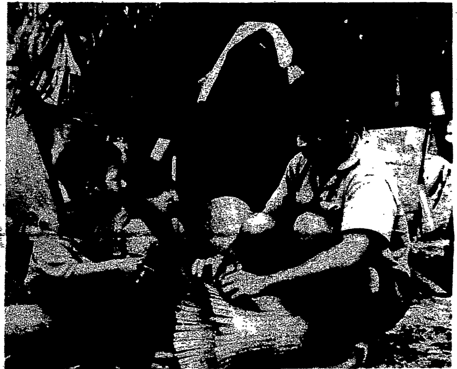
Refugee victims of war, mourning the death of mother and wife, look to the future with small hope. For such a sad little family, for such needy people all over the world, our Holy Father begs your prayers on WORLD MISSION SUNDAY, that in the sharing of your faith in Christ they may come to know and feel the healing, saving love of the Father. Please — give them your prayers, and share your faith with them through your sacrifice to the Propagation of the Faith on WORLD MISSION SUNDAY, October 24th.