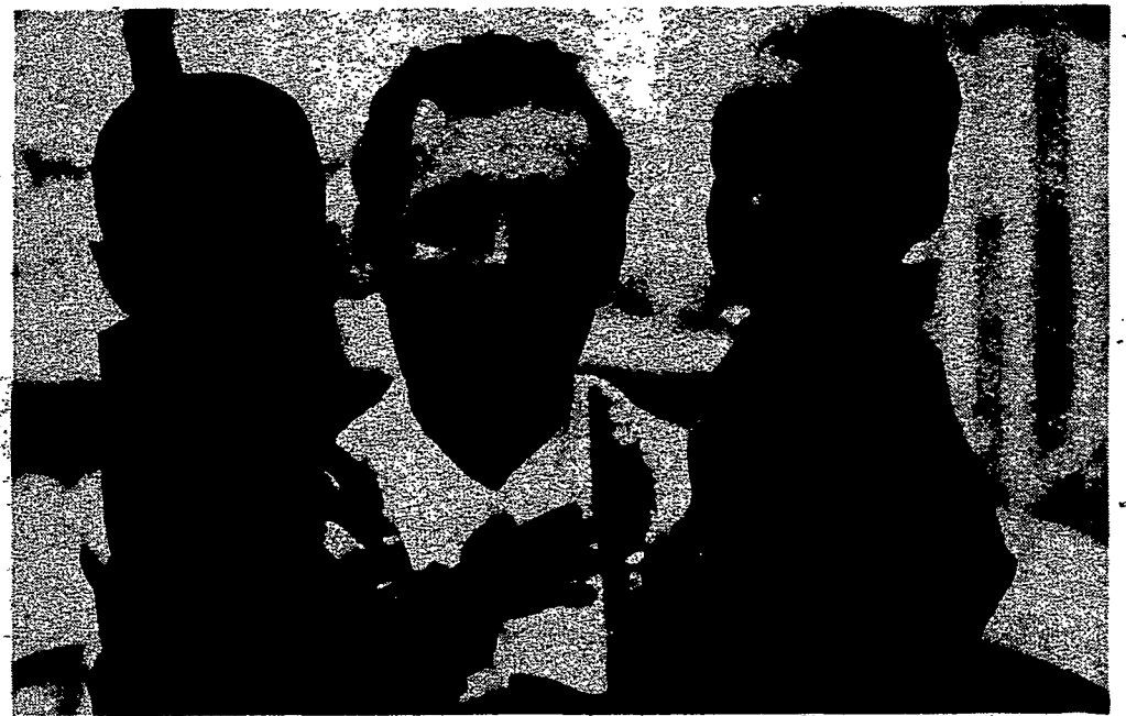
These Kenyan boys recognize Father's happiness which flows from his faith in Christ. "Your hearts will be full of joy, and that joy no one shall take from you." (Jn 16:22) Support for Catholic lay teachers in Mission schools is provided annually from the contributions made to the Society for the Propagation of the Faith.