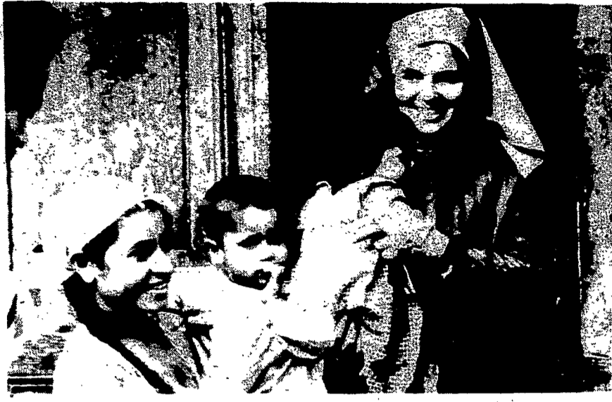
Mother Teresa has said what the poor really need is "a hug" someone to show them that they are loved by others, and by God. Through your prayer and sacrifice on Mission Sunday, you give the world a hug!