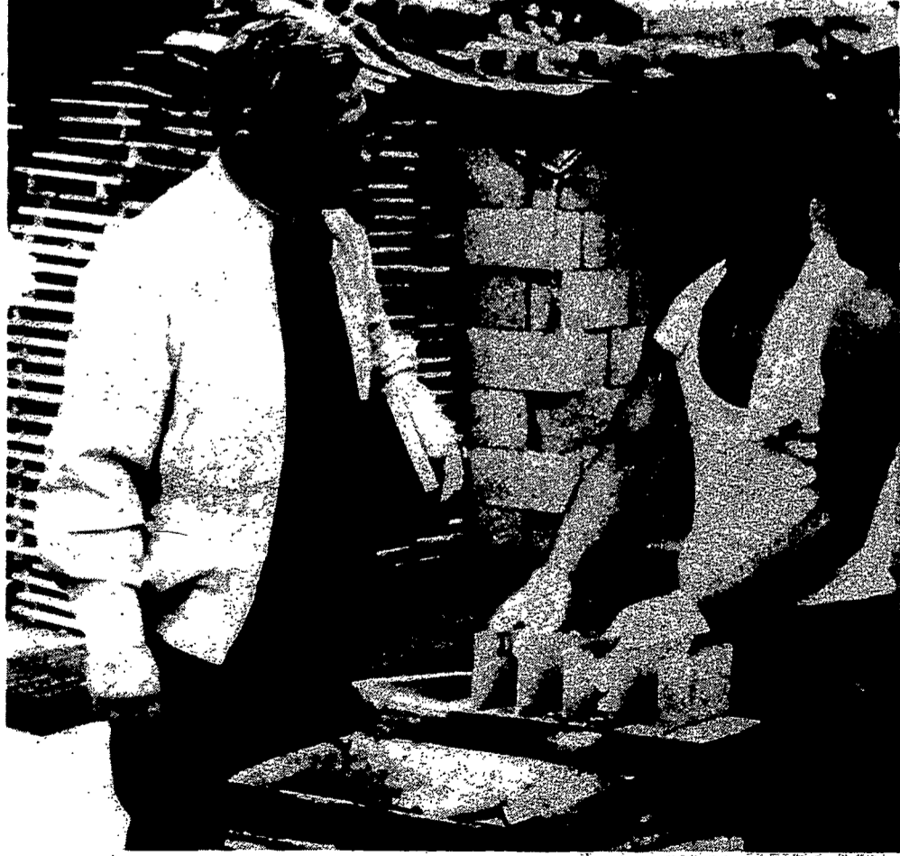
On October 24th, our Catholic family the world over will unite in prayer and sacrifice for the poor of the Missions. Your prayers provide spiritual energy for Christ's missionaries. Your sacrifice on Mission Sunday provides the means for the work of the Mission Church. Please be generous.

YOUR GENEROUS SUPPORT without boundaries of your parish: the prayers you give and the sacrifices you inspire will reach the ends of the earth.