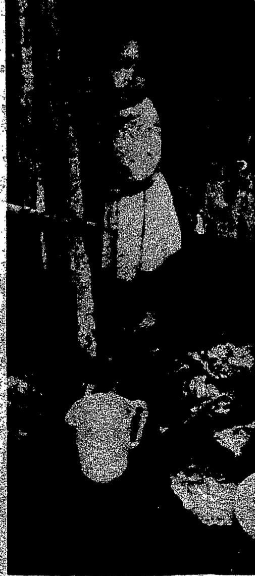
The generosity of Catholics to the Poor is literally the "daily bread" support for the work of the Mission Church around the world. Please support them. Your prayers and sacrifice on Mission Sunday, October 24th, will support the Mission World!