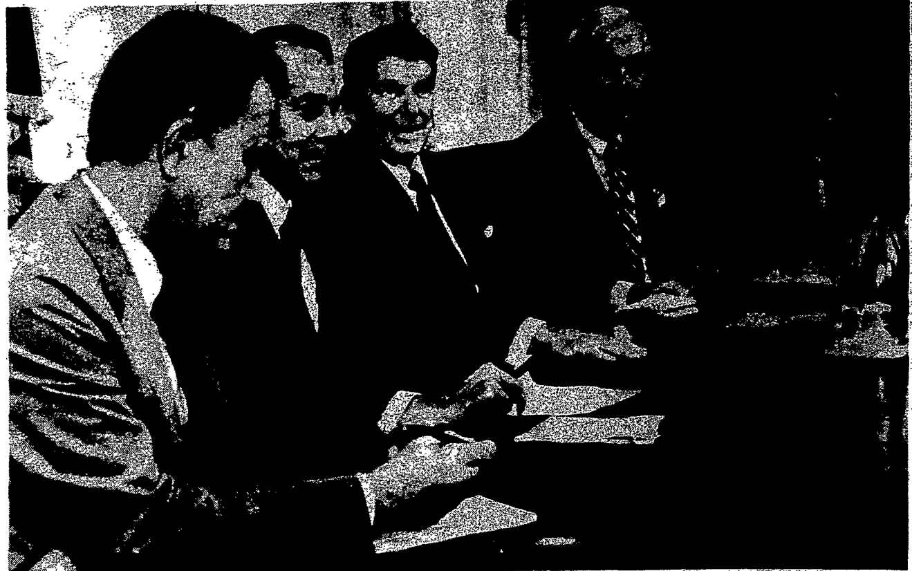
▲ At a White House meeting, President Ronald Reagan discusses tuition tax credits with three Senate supporters. From left are Sens. Robert Packwood (R-