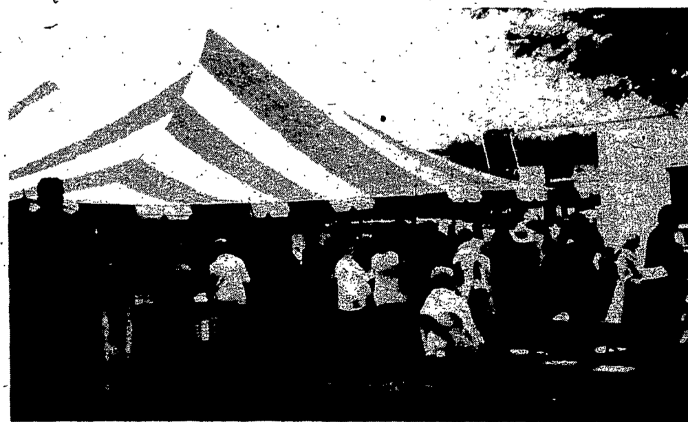
A scene from last year's festival at St. Jude's.