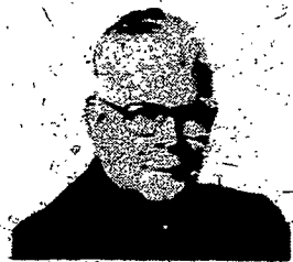
On the Right Side