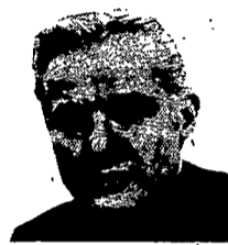
Looking for the Lord