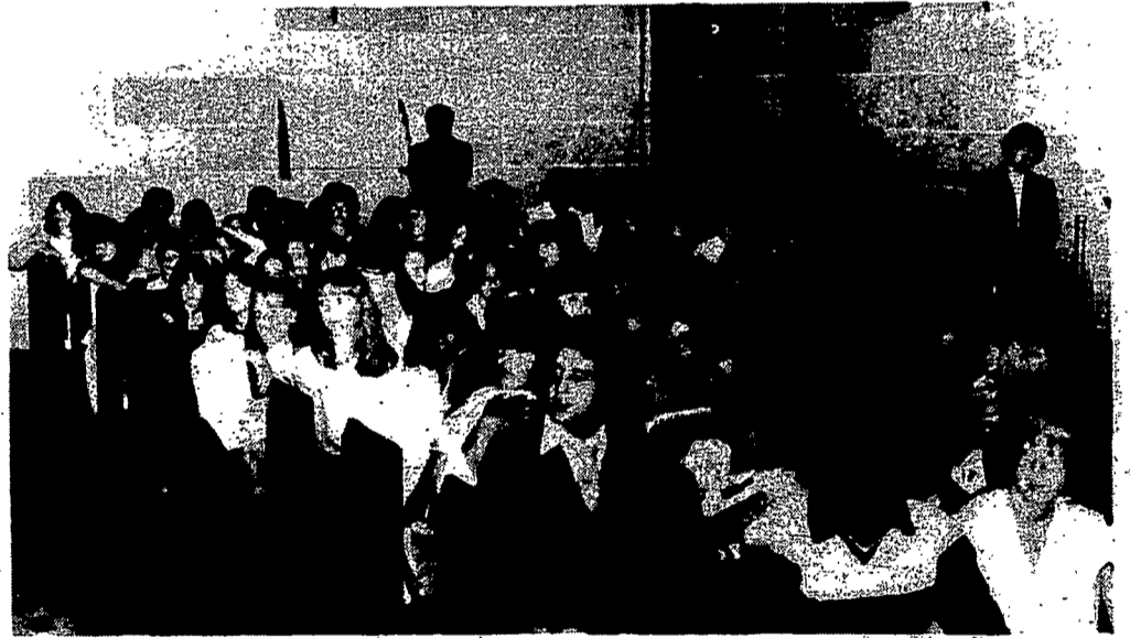
Vacationers from Camp Stella Maris joined the throng at the Cathedral.