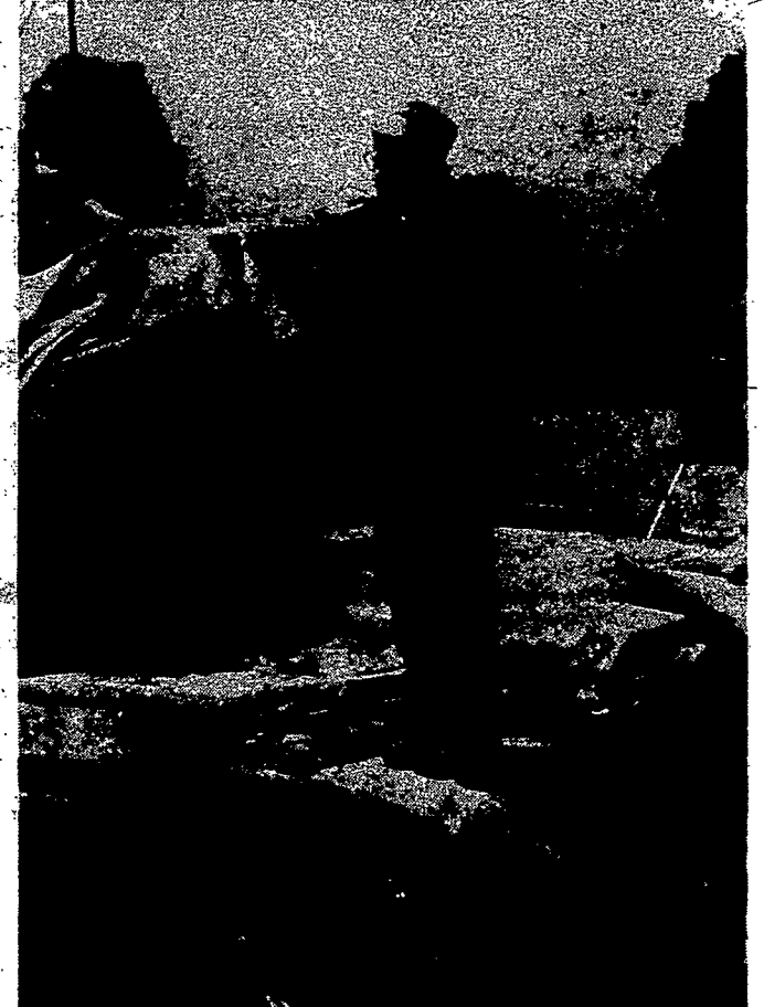
▲ Standing on a tank overlooking Beirut, an Israeli soldier leaves the battle behind to recite his prayers at the start of shabat (sabbath).