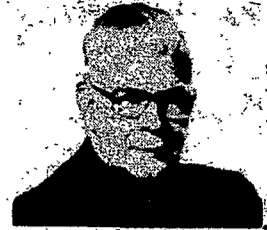
On the Right Side