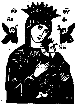
The Golden Madonna