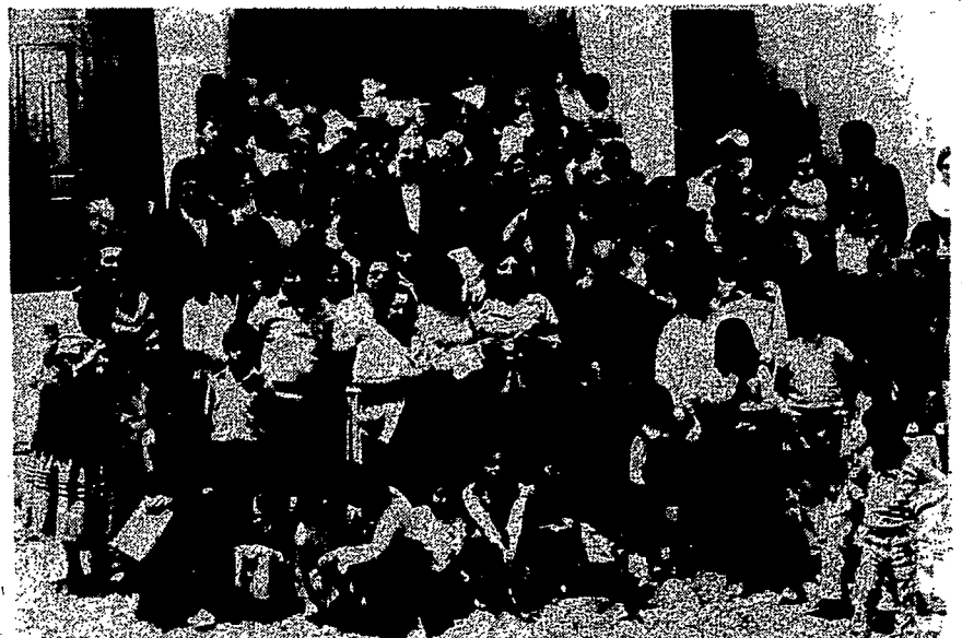
UNITY IN MISSION: Evangelization would not be complete if it did not take into account the rights and duties of every human being, of family life, life in society, peace, justice and development.