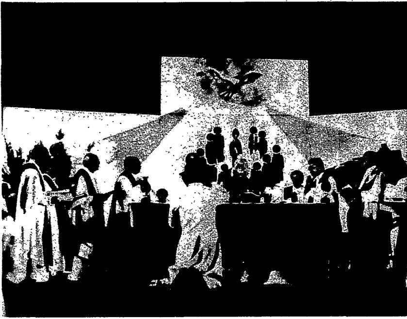
UNITY IN MISSION: Those who sincerely accept the Good News and who have been gathered by it into the community of salvation, can and must communicate and share it with others.