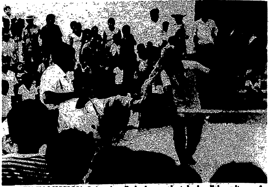
UNITY IN MISSION: It is primarily by her conduct, by her living witness of fidelity to the Lord Jesus, that the Church will evangelize the world.