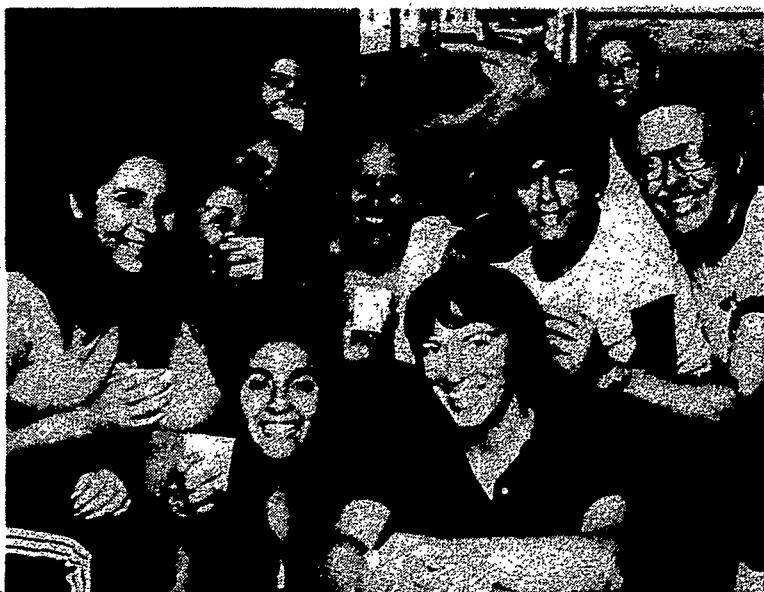
UNITY IN MISSION: The proclamation of the Good News reaches full development when it is listened to, accepted and assimilated, and when it evokes a genuine commitment in the one who has received it. Those whose lives have been transformed enter a community which is itself a sign of transformation, a sign of newness of life.