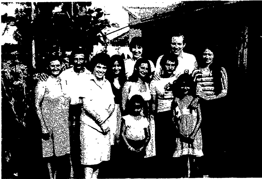
UNITY IN MISSION: This century thirsts for authenticity. Do you really believe what you are proclaiming? Do you live what you believe? Do you preach what you live?