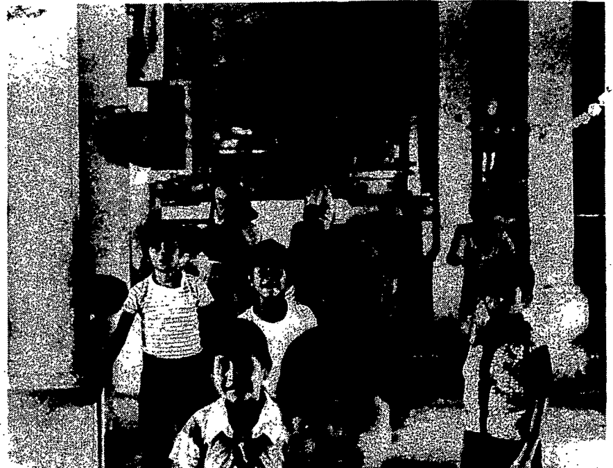
UNITY IN MISSION: Young people trained in faith and prayers must become more and more the apostles of youth.