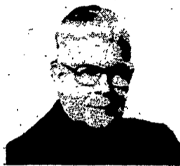
On the Right Side