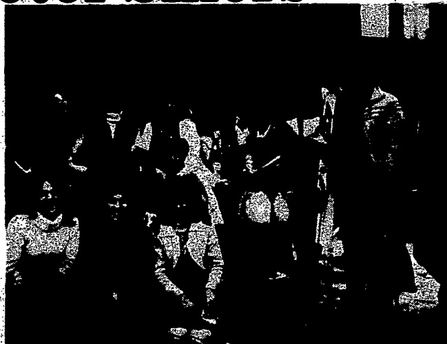
Nazareth and Aquinas skiers ready to take on the slopes.

The purpose of the program is to introduce young people to a lifetime sport, and of