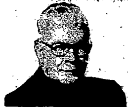
On the Right Side