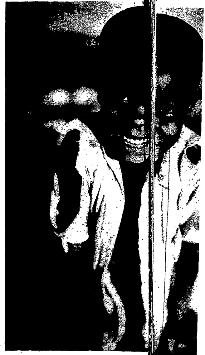
A two mile walk to school isn't so bad, if you hurried down and welcomed him joyfully." (Lk 19:6) Missions find lots of I welcome the children in the name of Christ, teaching, heal water.