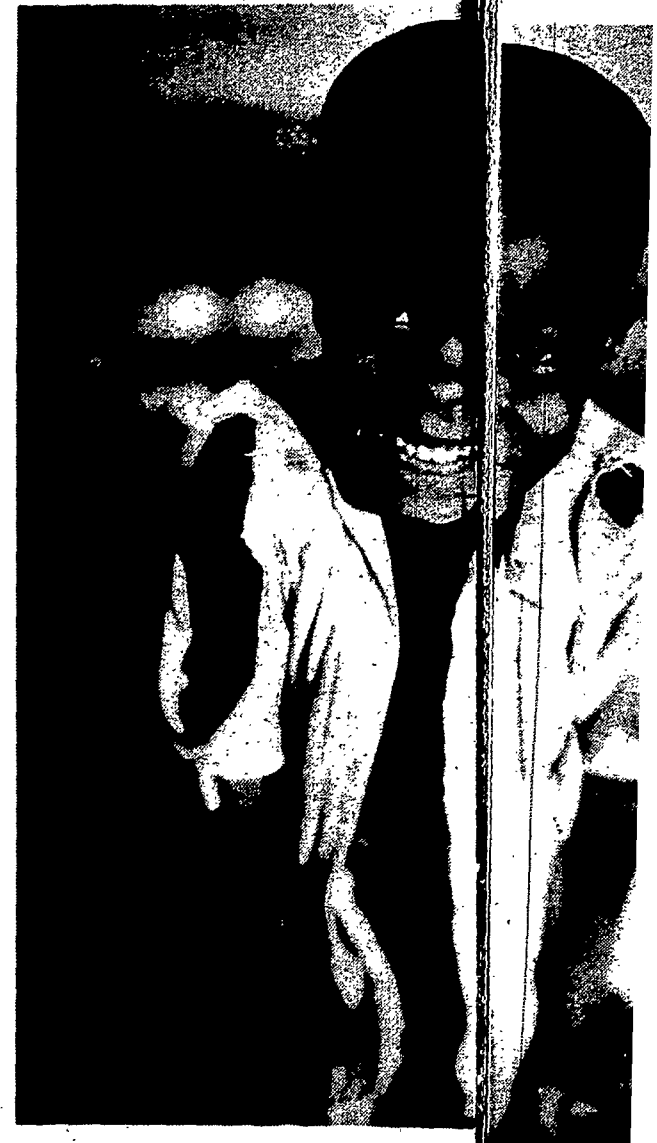
A two mile walk to school isn't so bad, if you hurried down and welcomed him joyfully." (Lk 19:6) Missions find lots of I welcome the children in the name of Christ, teaching, heal water.