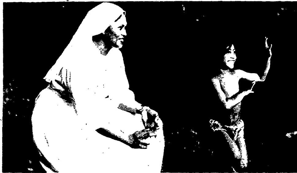
This local Sister in western Samoa and her small charge seem to exemplify the words of St. Peter in his first letter: "Without seeing Him, you are already filled with a joy so glorious that it cannot be described, because you believe." (1P 1:8) The Society for the Propagation of the Faith supports the training of native novices around the world. Share the joy of your faith in Christ on Mission Sunday.