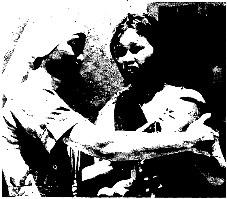
A small refugee in Southeast Asia is comforted by a mission Sister. Mother Teresa, in an interview at International Headquarters of The Society for the Propagation of the Faith in Rome, said, "All of us are missionaries . . . it is through us that God loves the world." MISSION SUNDAY, October 18th, is our special opportunity to love the whole world. Please pray and sacrifice for the Missions on Mission Sunday!