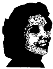
All in the Family