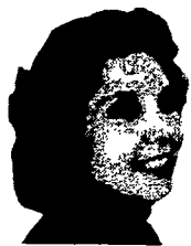
All in the Family