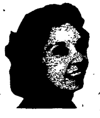
All in the Family