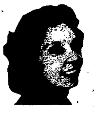
All in the Family