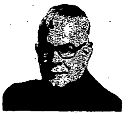
On the Right Side