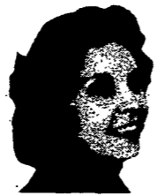
All in the Family