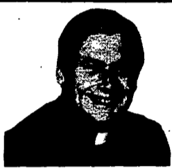
The Open Window