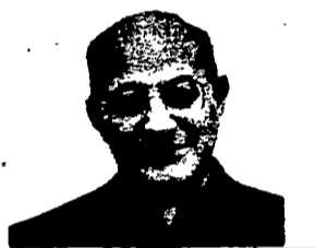
Word for Sunday