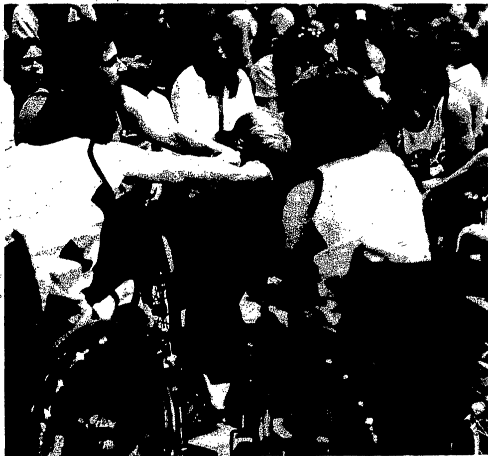
A moment together before the start of the game.

place in the Upstate New York Wheelchair Basketball Conference. Other teams in the league are Syracuse, Binghamton, Utica and Albany.