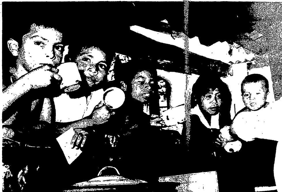
Children of El Salvador get nutritious food through funds donated to CRS.

employment and legal assistance for displaced Salvadoreans.