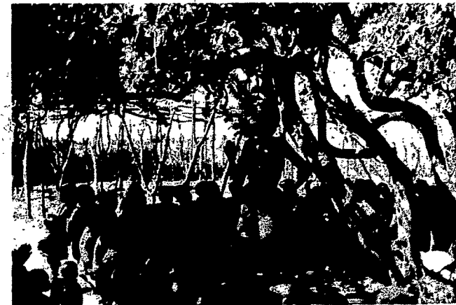
A nutrition program is being taught in drought-affected northern Kenya.

The release stated, "We want the Board of Directors of (Geneva General Hospital) to forbid the use of the hospital for abortions, since such an act neither heals nor saves lives. Such acts do kill helpless, defenseless, voiceless, not yet born human beings."