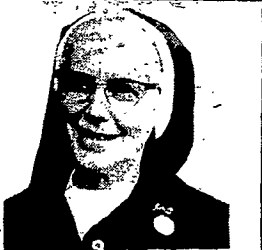
Viewpoint: Sisters Reflect