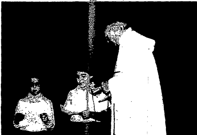
Looking to the Future

Students at St. Jerome's School prepare, not for air flight, but for a number of life's activities requiring muscle tone, through parachute exercises in physical education class.