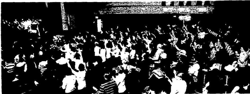
About 400 attended the Charismatic Renewal program.