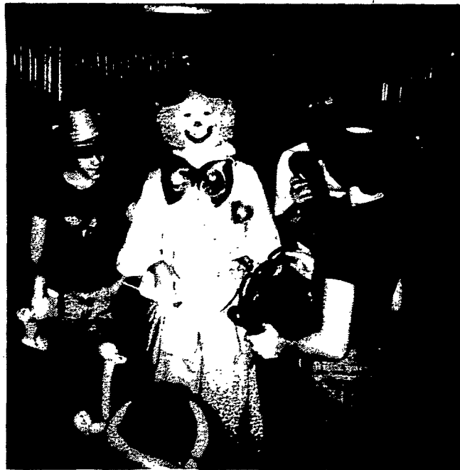
Sunflower the Clown prepares for tomorrow's events.