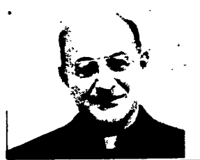
Word for Sunday