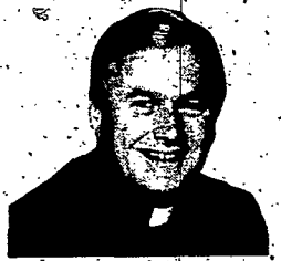
The Open Window