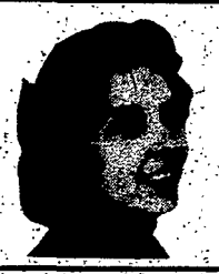
All in the Family

As a perpetual dieter, determined to wear the same dress size after the holidays as before, this writer knows all too well how fraught with danger is this the most sociable of all seasons.